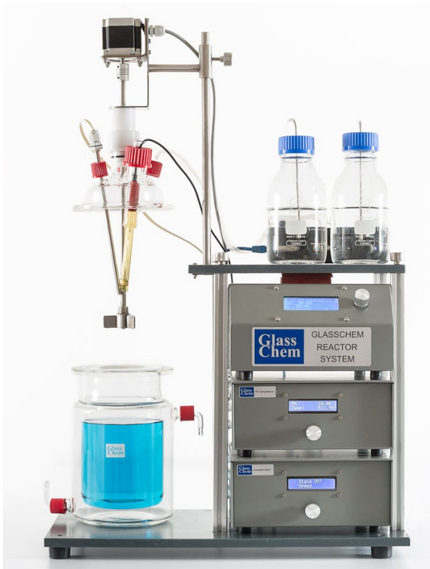
Reactor stirrer and lid, lifted above reactor to remove the reactor vessel