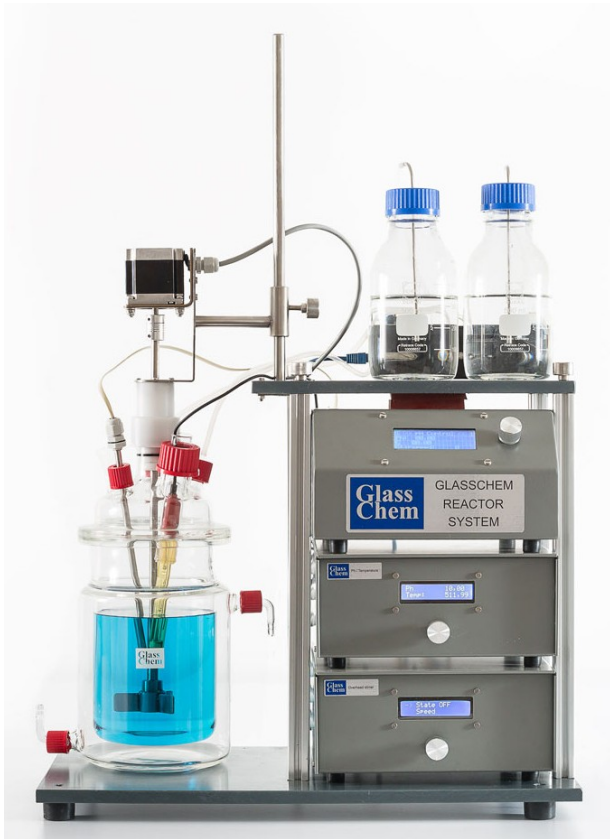
Reactor lowered in working position